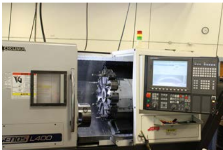
Our Okuma GENOS 400.

We've also made some other investments in order to move CPV forward. We now have two new CNC lathes from Okuma: the LB3000 EX-II, and the GENOS 400. The LB3000 is a horizontal CNC lathe that prevents thermal growth while in use. It also provides the ability to hold close tolerances and produce the high quality products we do. The GENOS is multifunctional, and offers stability, rigidity, and accuracy in its use. Both of these machines are helping to create more efficiencies in our manufacturing process.