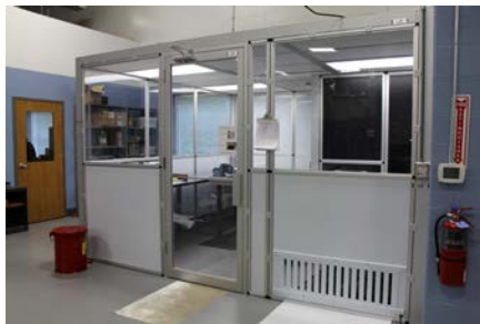
Our class 10,000 clean room.