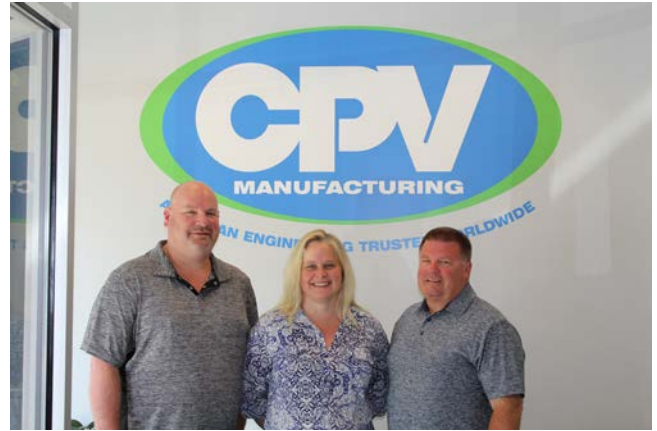
The production team.