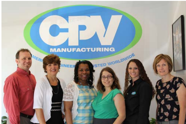
The customer service team.