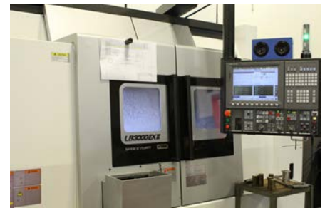
Our Okuma LB3000 EX-II.